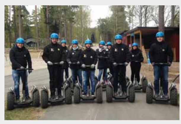
Axelent Academy. Participants from Axelent in Germany and Spain trying their hand at offroading with segway.

For two days, Axelent Academy played host to seven new employees from Axelent GmbH and Axelent Spain. The introduction took place at the head office in Hillerstorp. In addition to a tour of the plant with a longer stop-off at certain departments, the group also visited some important suppliers. The tour was topped off with a course in Axelent's product range and how to assemble the products.