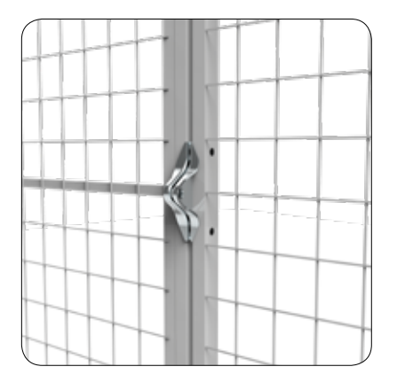
Padlock cover (for F-system) - Can be used on all doors to protect the padlock.